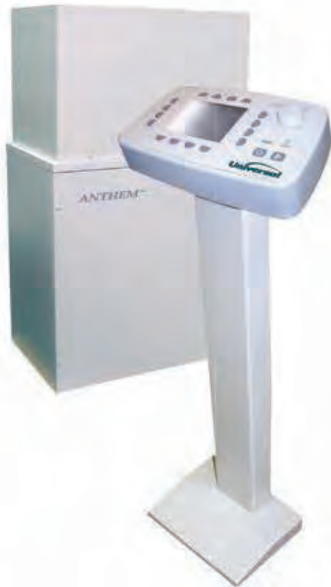
Pictured with optional pedestal mount